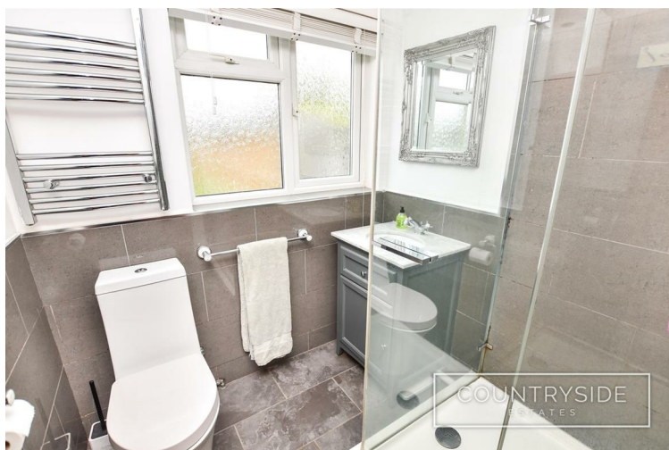
Ground Floor Shower Room 6'3 x 5'8 (1.91m x 1.73m )

Upvc double glazed obscure window to rear, tiled flooring, smooth plastered ceiling with inset spotlights, half tiled walls, shower cubicle with glass door, chrome heritage shower fittings with rainfall head, vanity unit with marble top and inset handwash basin with chrome mixer tap, close coupled W.C, wall mounted chrome heated towel rail.