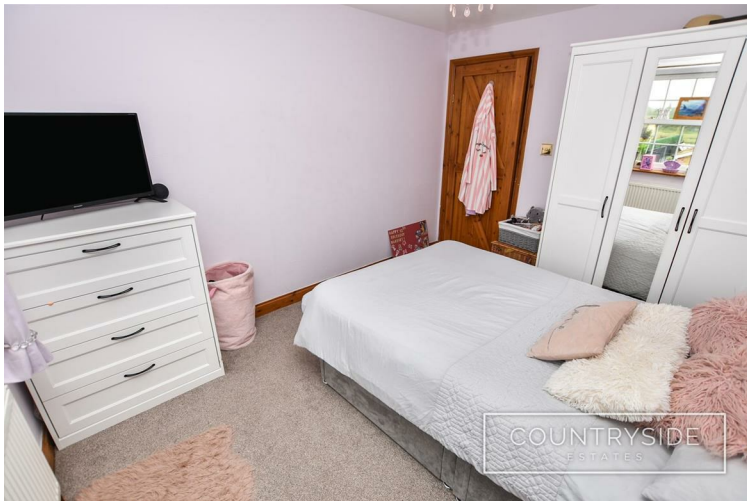
Bedroom Three 11'4 x 9'6 max (3.45m x 2.90m max)