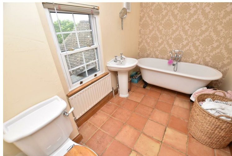
Upvc double glazed sash window to rear aspect, tiled flooring, smooth plastered ceiling, radiator, free standing Victorian bath with chrome mixer tap and handheld shower, pedestal hand wash basin with chrome twin taps, close coupled W.C, built-in storage cupboards, radiator.