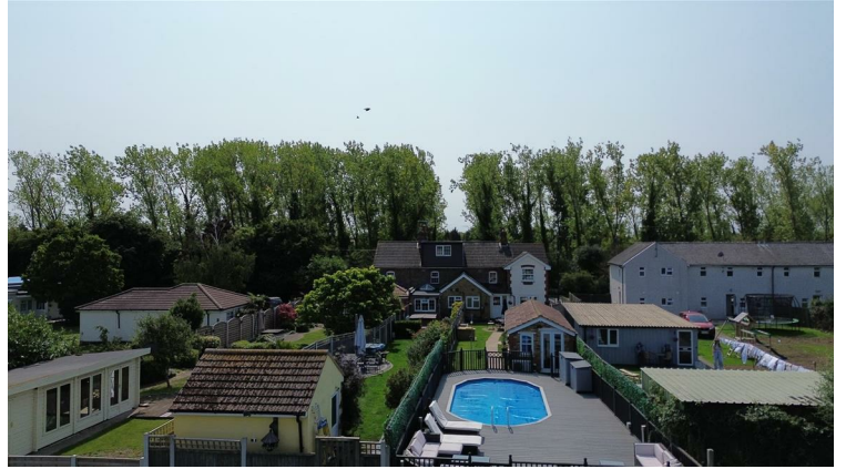
Outbuilding/Leisure Room 21'7 x 9'3 (6.58m x 2.82m)