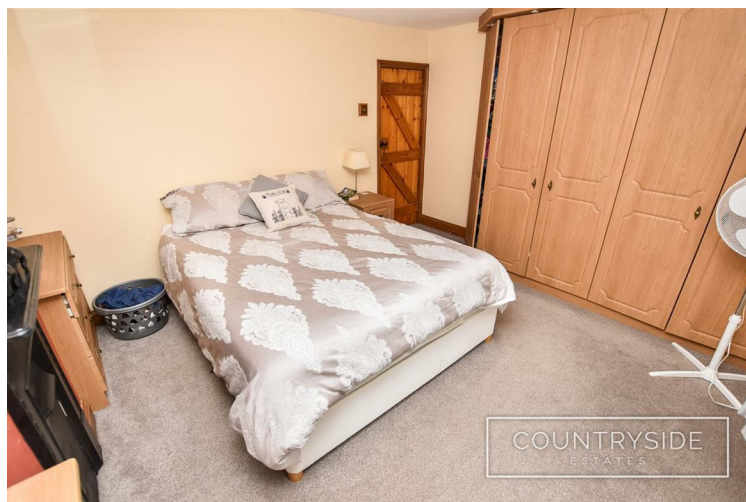
Bedroom Two 11'6 x 9'6 (3.51m x 2.90m)

Upvc double glazed sash window to front aspect, carpet, smooth plastered ceiling, range of fitted bedroom furniture and wardrobes, feature cast iron fireplace, radiator, power points.