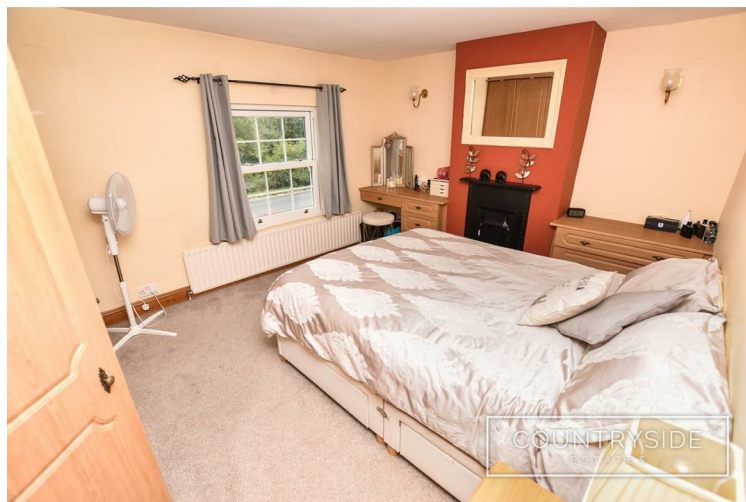
Bedroom One 13'0 x 11'0 (3.96m x 3.35m )

Upvc double glazed sash window to front aspect, carpet, smooth plastered ceiling, range of fitted bedroom furniture and wardrobes, feature cast iron fireplace, radiator, power points.