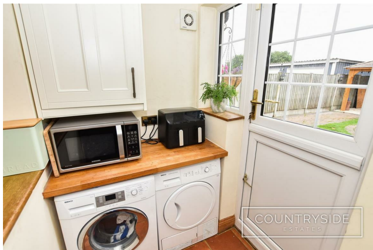
Utility Room 10'1 x 4'10 (3.07m x 1.47m)

Upvc double glazed window and stable door to rear garden, tiled flooring, smooth plastered ceiling, fitted wall unit matching kitchen and oak worktop, space for washing machine and tumble dryer, pantry cupboard, power points.